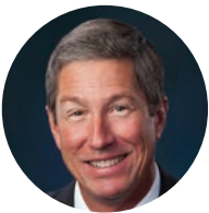
MAYOR Rex Hardin