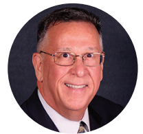
COMMISSIONER Barry Moss District 5