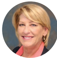
COMMISSIONER Rhonda Eaton District 2