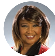
COMMISSIONER Beverly Perkins District 4