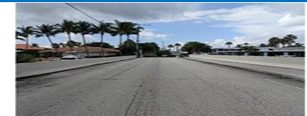
Terra Mar Drive Bridge Repair and Watermain Improvements