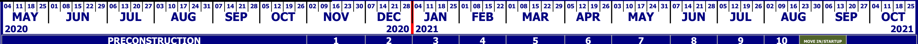
THIS IS A SUMMARY SCHEDULE, PRESENTED AS A WEEKLY TIME SCALED NETWORK LOGIC DIAGRAM, A FORM OF CPM WHICH EASES ILLUSTRATION OF THE MULTIPLE INDEPENDENT YET INTEGRATED PATHS TO COMPLETION