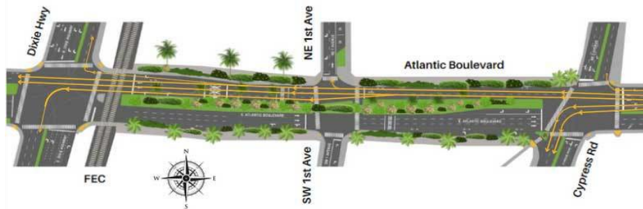
Partial Site Rendering - Atlantic Blvd. from Dixie Highway to Cypress Road