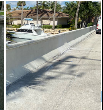
Aluminum extrusion/bracket @ Terra Mar Drive Bridge (South)