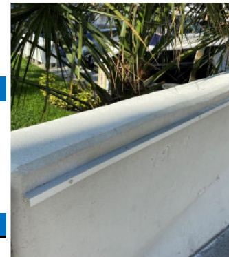
Aluminum extrusion/bracket @ Terra Mar Drive Bridge (South)