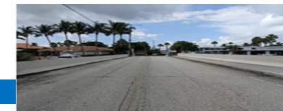
Terra Mar Drive Bridge Repair and Watermain Improvements