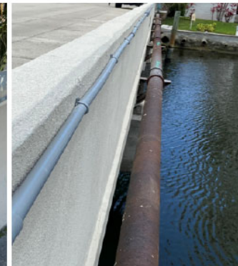
Electrical PVC Conduit @ Terra Mar Drive Bridge (South)