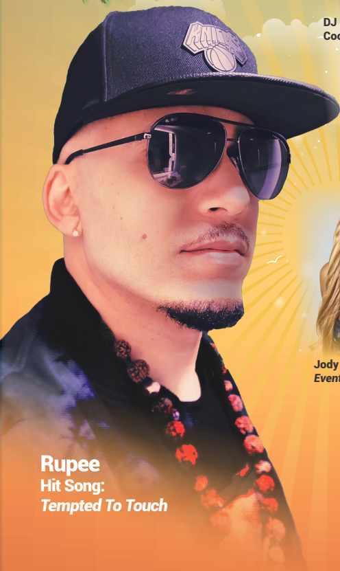
Rupee Hit Song: Tempted To Touch