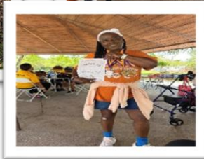
Winners! Seniors proudly showed off their trophies, medals, and certificates