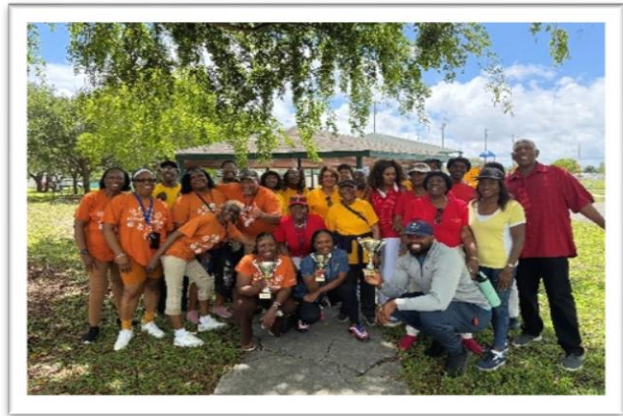
Senior Games Walk Race Winners! 1st-Pompano Beach 2 nd Miramar and 3 rd West Park. Great job to all participants.