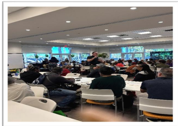
Our members were fully engaged during the Fraud Prevention presentation.