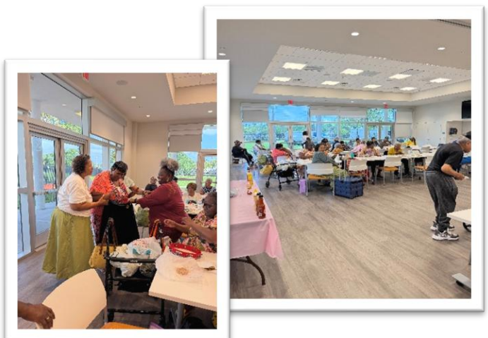
Our Senior Program Fish Fry & Fun Day was a huge success! A great time was had by all in attendance.