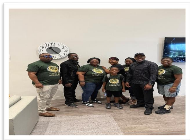
Staff members from A Good Shepherd's Funeral Home presented amazing gifts for wonderful fun filled games of Bingo.