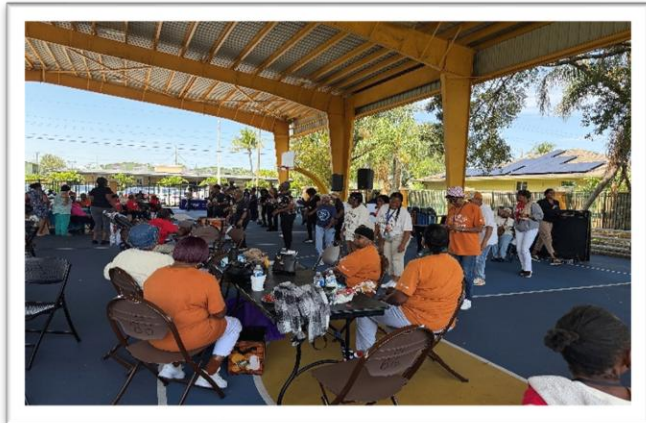
Taste of Wellness -Seniors were able to enjoy a fun day sponsored by Broward County Parks & Recreation at Franklin Park