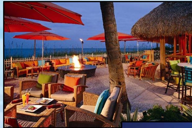
Outdoor cafes and dining