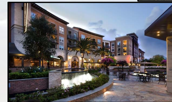
Active sidewalk and public spaces