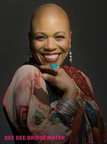
DEE DEE BRIDGEWATER