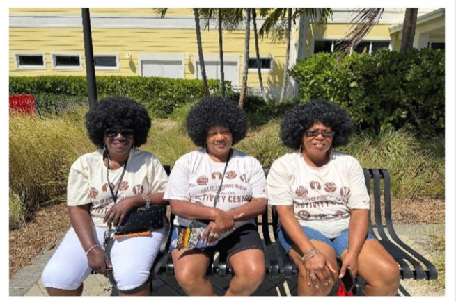
Field Trip FRO's – Enjoying some sun while taking a break at Manatee Lagoon.