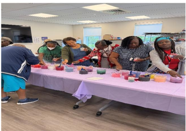
Arts & Crafts-Personalized Scented Candles